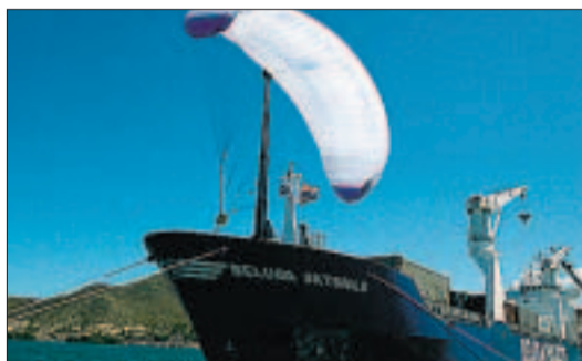
"BELUGA SKYSAILS": Heading for two ports in Norway

Her funeral took place in Athens on 19 February.