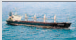
"ALAM SELARAS"

••• The 39,000-dwt bulker Alam Selaras (built 1992) has reportedly been sold to an undisclosed buyer for $44m.