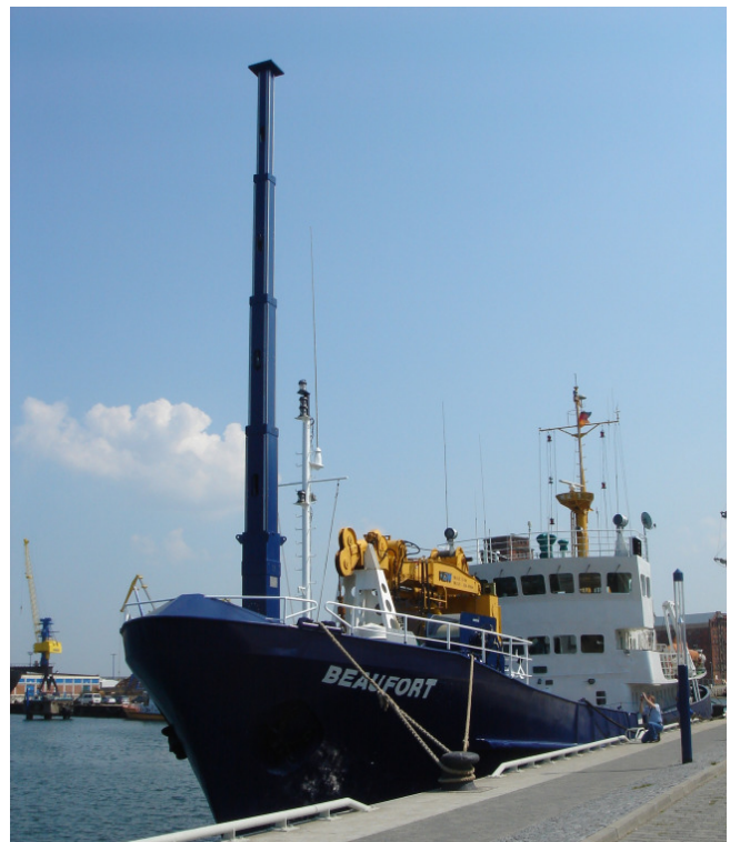
After retrofitting with extended telescopic mast for large SkySails systems