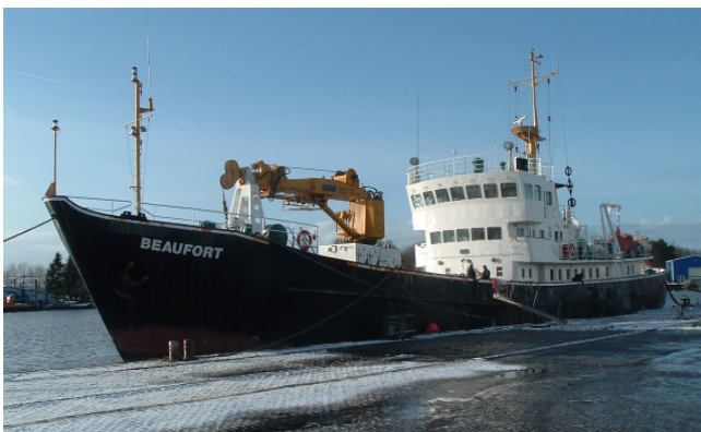
Test vessel Beaufort - before retrofitting