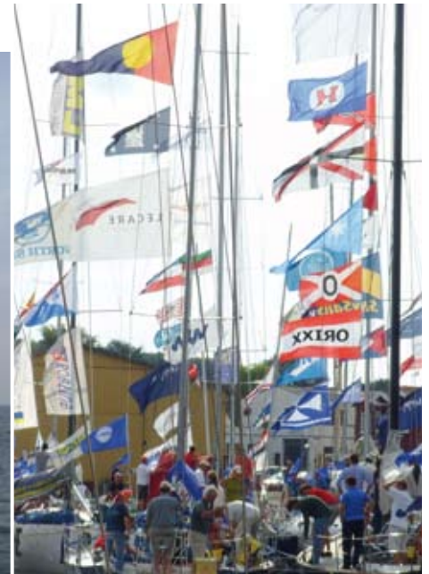
BELOW: RELAXED ATMOSPHERE AT THE FIRST-SHIP-HOME-PARTY

Alongside ship owners and other representatives from the shipping industry politicians also regularly take part in the regatta - this year Schleswig-Holsteins premier Peter Harry Carstensen joined the regatta. SkySails plans to also take part in next year's regatta with over 1,000 participants.