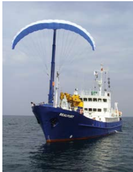
ABOVE: THE BEAUFORT AT THE SHIPPING REGATTA

Over 600 guests from the shipping industry celebrated the "First-Ship-Home-Party" on 25th of August, the evening before the 24th Shipping regatta, happily far into the night. The party consisted of great company, food, drinks, live music, and up-close informational tours aboard MS Beaufort regarding SkySails innovative technology. On the following day, the MS Beaufort joined the regatta. The shipping regatta organised by Peter Gast Shipping has been one of the main events of the German shipping industry over the last 24 years. Thereby over 100 yachts sail from Maasholm (Schleimünde) to Ærøskøbing on the Danish island Ærø.