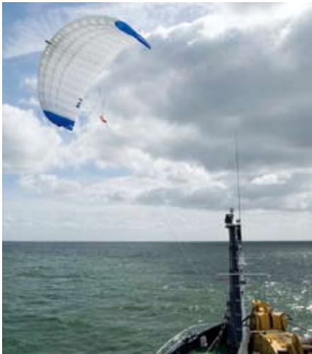
LAUNCH OF THE TOWING KITE

der real conditions for the first time. One goal to be obtained from this research is a structured training program for future SkySails captains. In the future, the SkySails system will use comparably large towing kites to propel fishing trawlers, smaller cargo ships, and super yachts. The use of this new technology can reduce fuel costs by between 10 to 35% on annual average. Under optimal wind conditions fuel consumption can be temporarily reduced