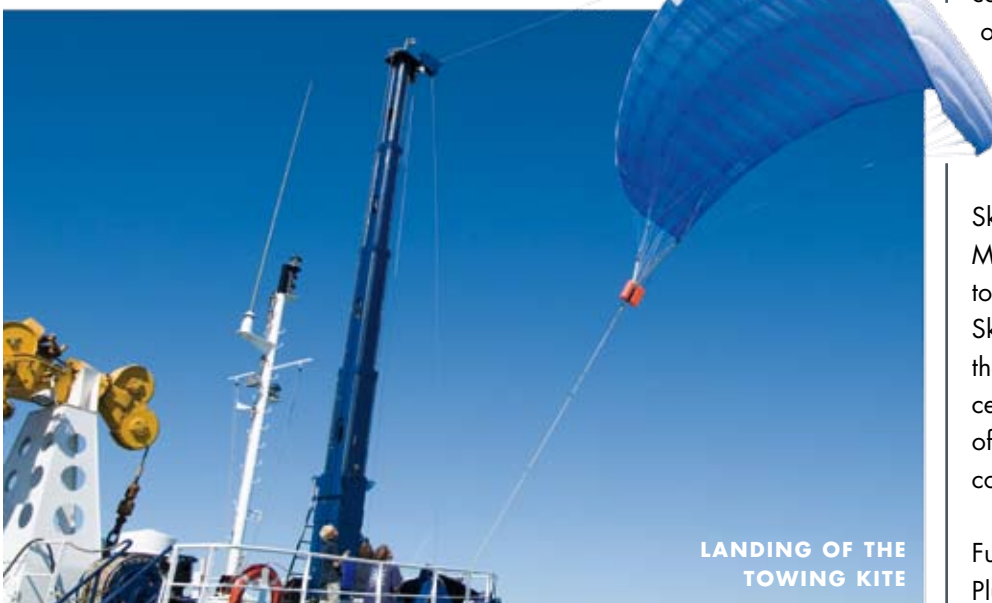
LANDING OF THE TOWING KITE

The flying SkySails-System on the MS Beaufort will be presented to the public for the first time by the end of this year. In 2007, the first pilot systems will propel large cargo ships for SkySails first system purchaser, Beluga Shipping GmbH, from Bremen, Germany. Beluga purchased the first system in January of 2006 for one of its cargo ship new-builds. In 2008, the first SkySails-Systems will be ready for series-production.